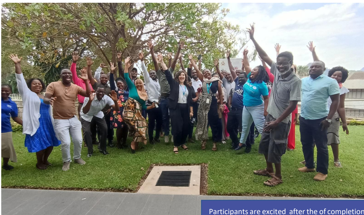
Participants are excited after the completion of the Shock Responsive Social Protection course.