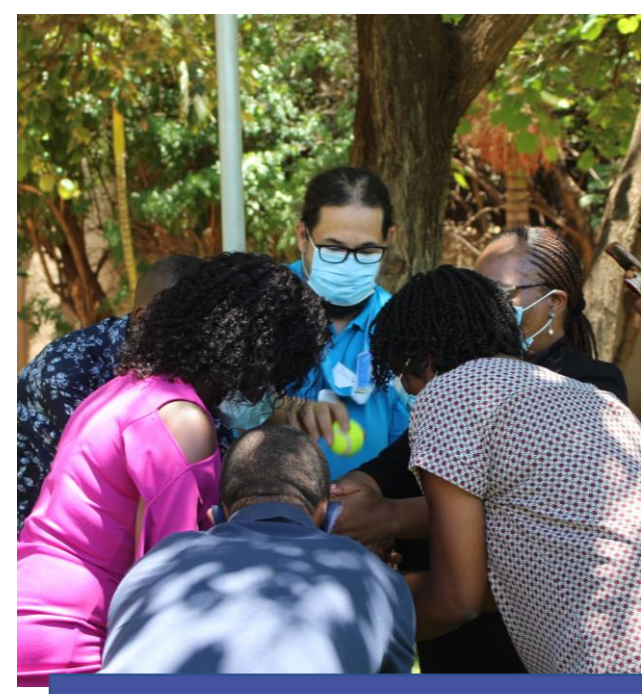
Team building through innovation: the Leadership Ball Game during the pilot of the Leadership and Transformation training

While the pilot allowed trainers and the Coordination Hub to appreciate potential for improvement in the content and flow of the training module (to be finalised in 2022), the overall feedback by participants was enthusiastic, with the overall feedback assessment scoring 9 out of 10.