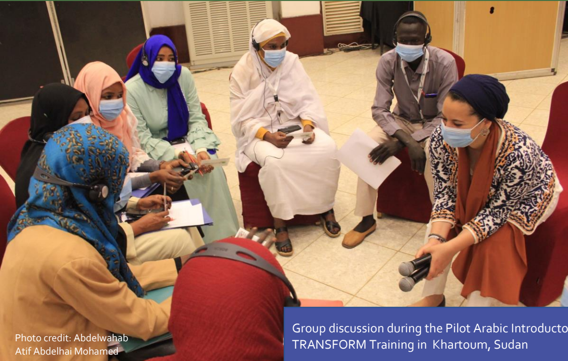
Group discussion during the Pilot Arabic Introductory TRANSFORM Training in Khartoum, Sudan