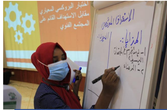
Participants making a presentation during the TRANSFORM training in Sudan

Participants expressed deep appreciation for the content and methodology of the TRANSFORM training, to which they were exposed for the first time. All of them rated the training between Excellent and Good, especially highlighting that the course had improved their knowledge of social protection; that they can practically apply many of the learning in their daily work and that their mind-set around social protection had shifted. They rated the team facilitators highly, indicating that they found the Master Trainers to be friendly, energetic and knowledgeable. While a representative from the EU delegation opened the training, the Permanent Secretary of the Ministry of Social Development of Sudan participated to the closing ceremony. The Official commended the organising team and participants for their commitment and requested that similar opportunities for capacity building replicated by ILO during the course of the EU-funded programme on social protection system strengthening.